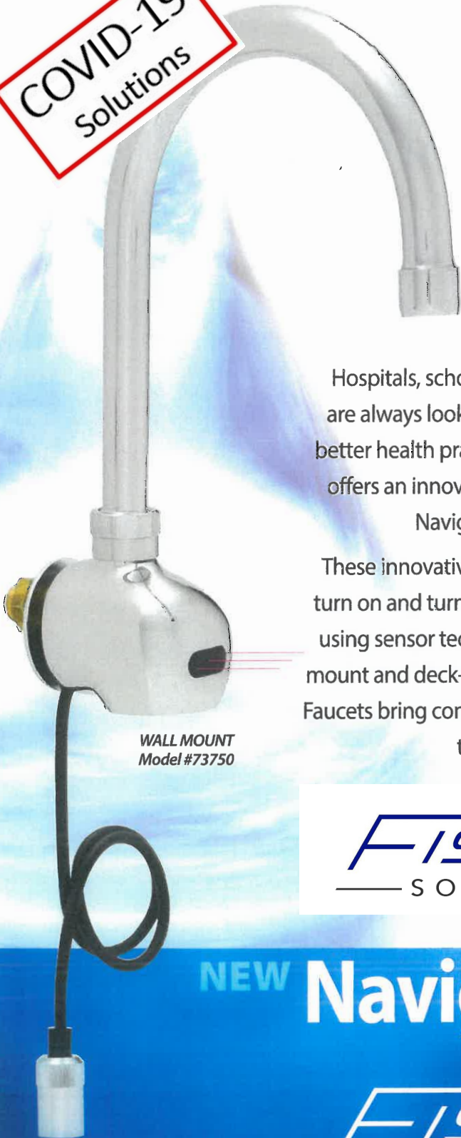
WALL MOUNT Model #73750

Hospitals, schools and foodservice operations are always looking to conserve water, promote better health practices and cut costs. Now, Fisher offers an innovative way to do it all — with the Navigator™ Sensor Faucets.