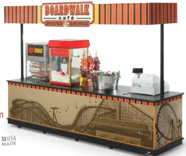
V-Class Custom Merchandising Carts