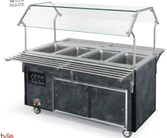
Signature Server® Serving Line