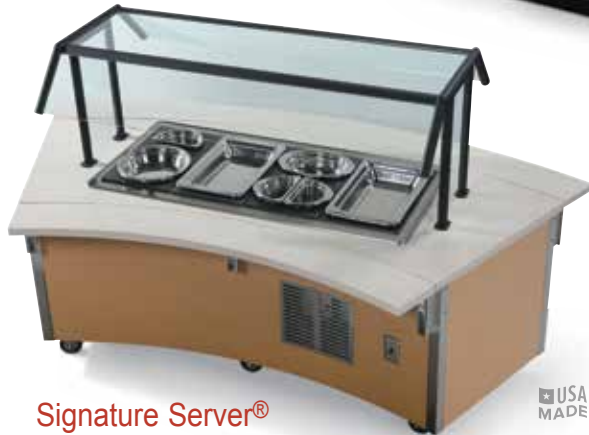
Signature Server® Serving Line

V-Class Custom takes style, innovation, and rugged durability to a whole new level