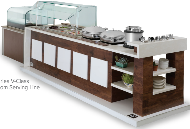
6-Series V-Class Custom Serving Line

* cannot be combined with other offers, rules and restrictions may apply, please consult with your Vollrath sales representative for details