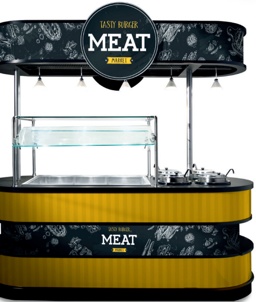
6-Series V-Class Custom Merchandising Carts

The Vollrath Company, L.L.C. • 1236 North 18th Street • Sheboygan, WI 53081-3201 • U.S.A.