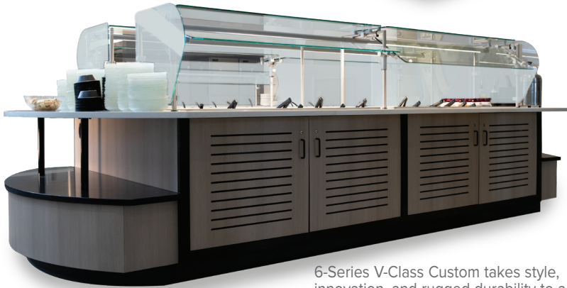
6-Series V-Class Custom takes style, innovation, and rugged durability to a whole new level